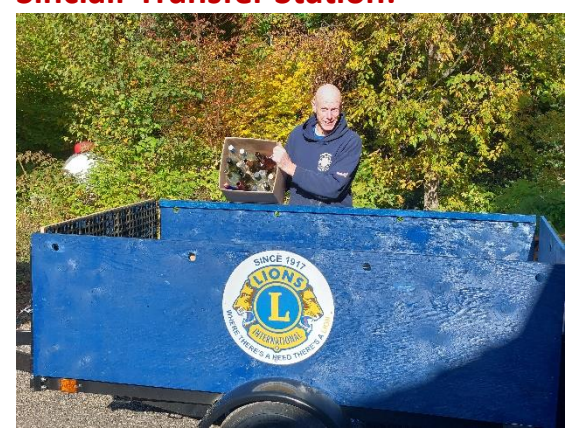
Page 2 Sinclair Transfer Station:

After some discussions at a recent AGM on the issue of returnable bottles, I met with the Dwight Lion's Club and the deal was made. For those who may have attended the site on this past weekend you will have noticed their trailer is now there by the re-use Building and ready to accept your donations.